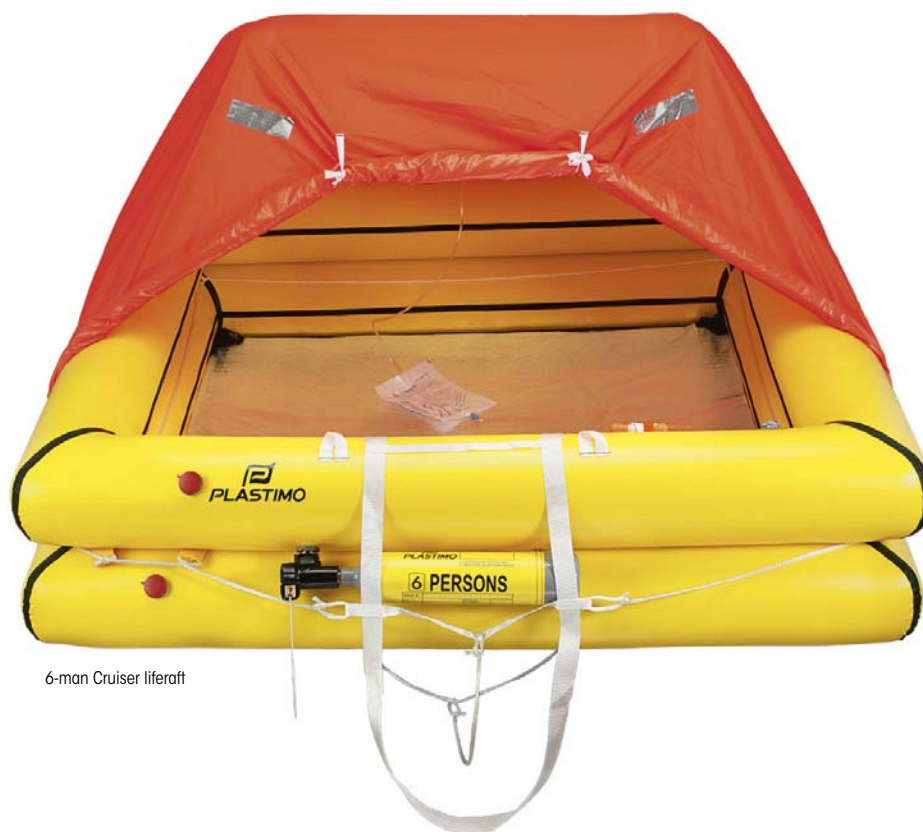
6-man Cruiser liferaft